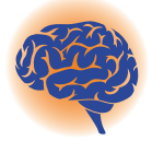
Encephalitis (inflammation of the brain)