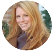
Lawyers Without Borders