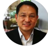
Shanghai Association of Foreign Investment