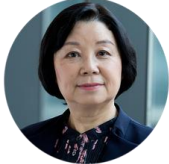
Asia Infrastructure Investment Bank (AIIB)