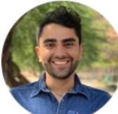
Project Everest Ventures