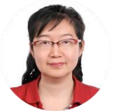
GE Renewable Energy