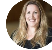
The University of British Columbia